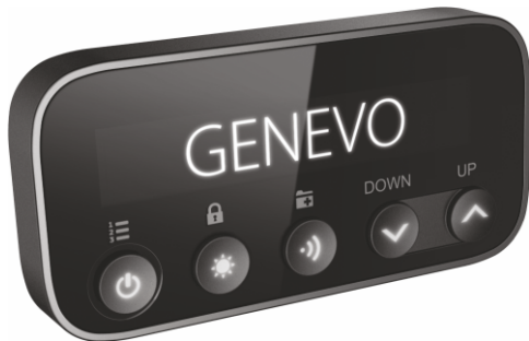
Radar Detector Genevo PRO